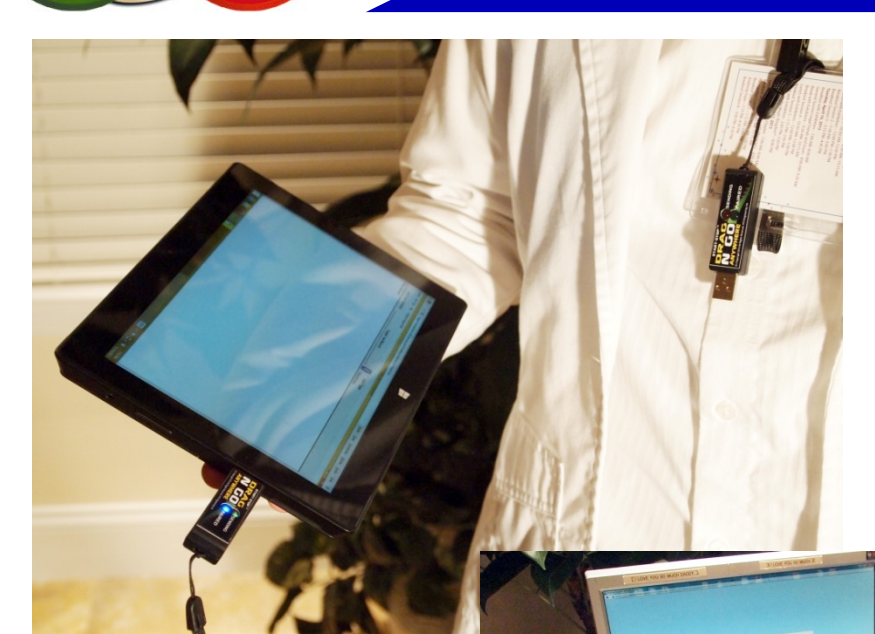
1) Run Dragon Medical on any Windows device (e.g. Tablet, Laptop, Ultrabook).

Take Dragon wherever you go! ©2011-2013 All Rights Reserved – HTH Engineering, Inc. Tarpon Springs, FL 34688 TEL: (727) 939-8853 http://www.StartStop.com