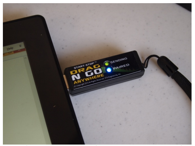
Take Dragon wherever you go!